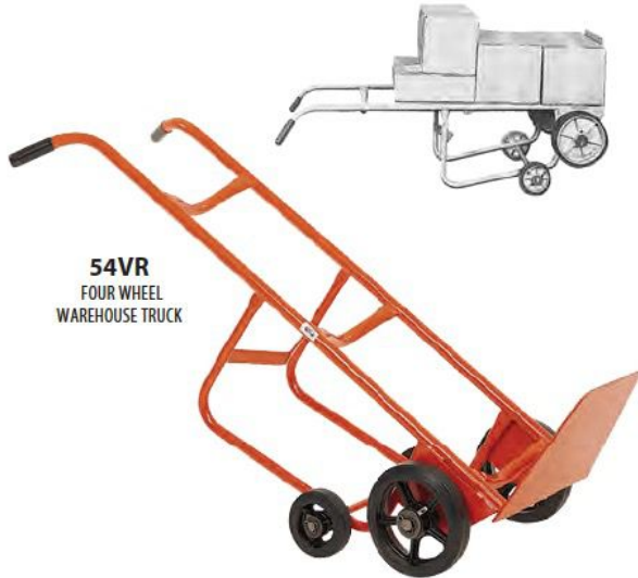
54VR FOUR WHEEL WAREHOUSE TRUCK