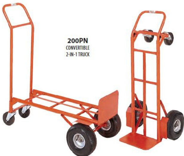
200PN CONVERTIBLE 2-IN-1 TRUCK